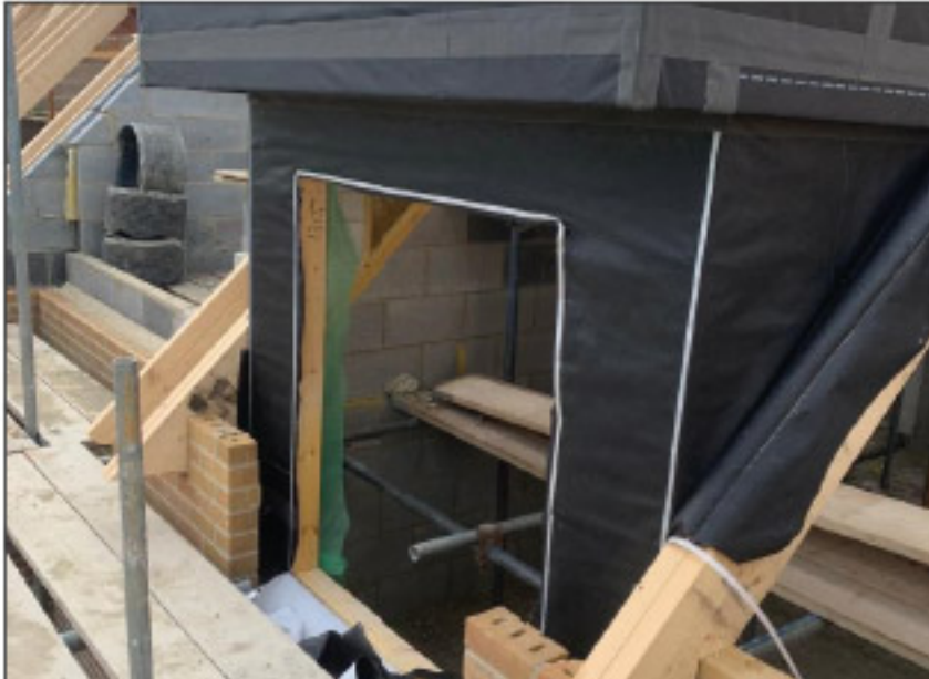
Fully Designed & Engineered

Dormers enhance a 'Room In Roof' design and create additional full height space – we offer a standard prefabricated or bespoke dormer solution to ensure quality, enhance speed of build and reduce working at height. An insulated dormer built offsite as part of your total roof solution from Crendon. All dormers are fully engineered to your design and supplied to site either as a 'kit' or 'complete' ready to install.