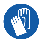
Hand Protection Gloves can be removed to untie/tie rope knots