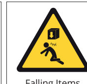
Falling Items from Above