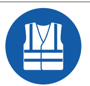
Hi Vis Wear