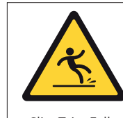
Slip, Trip, Falls